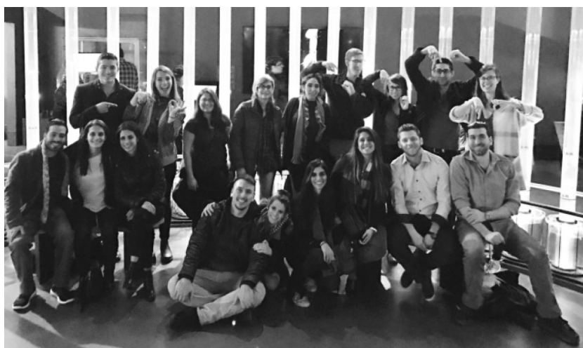
▲ Young Members Night Out- Exploratorium Museum (12/29)

The most impactful change announced this year was the partnership with Aegis Communications, the publisher of Compendium of Continuing Education in dentistry beginning with Volume 38.